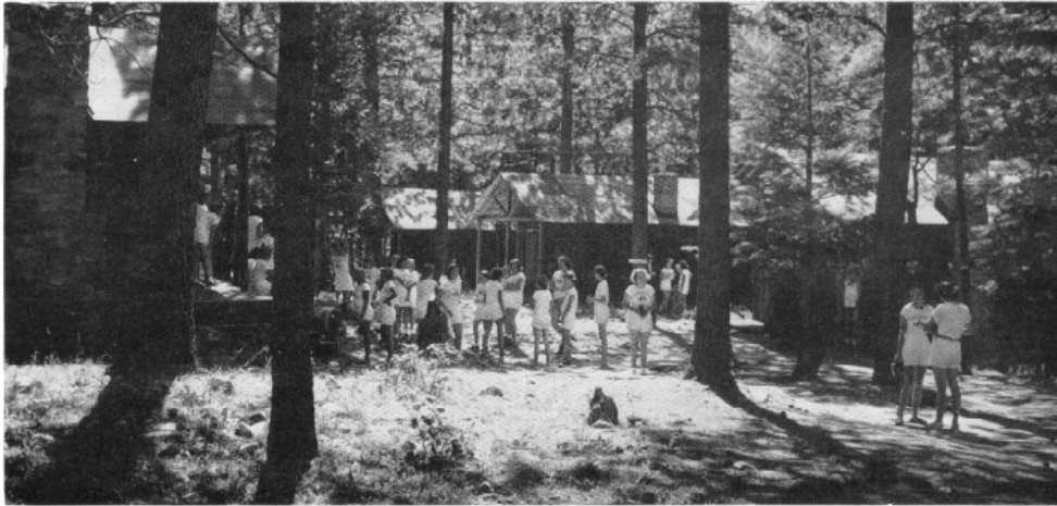
Cabins among the trees at Camp Davis