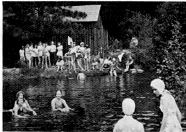
The old swimming hole