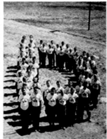
Campers form a "D"

The boys were part of the group who each summer visit Camp Davis on the Gascon Ranch, in the high country 30 miles northwest of Las Vegas. Boys from eight through 16 and girls from 10 to 17 attend this private camp in June and July, and most of them hate to leave to make room for the family camp in August.