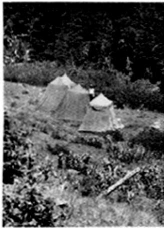
The pack-trip camp